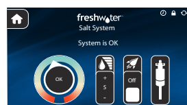
Touch Screen Display

The recommended initial output level is 5-7 (see Appendix on page 13). Your setting may change once you begin to use the spa. Consult dealer for initial settings and/or individual circumstances.