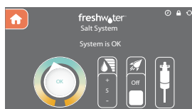
Touch Screen Display