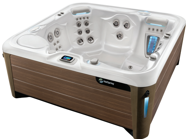
Aria shown with Alpine White shell Walnut cabinet