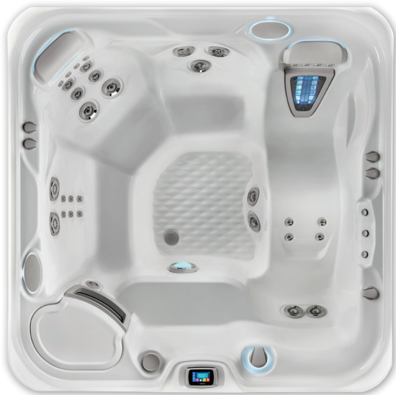
Aria shown with Alpine White shell