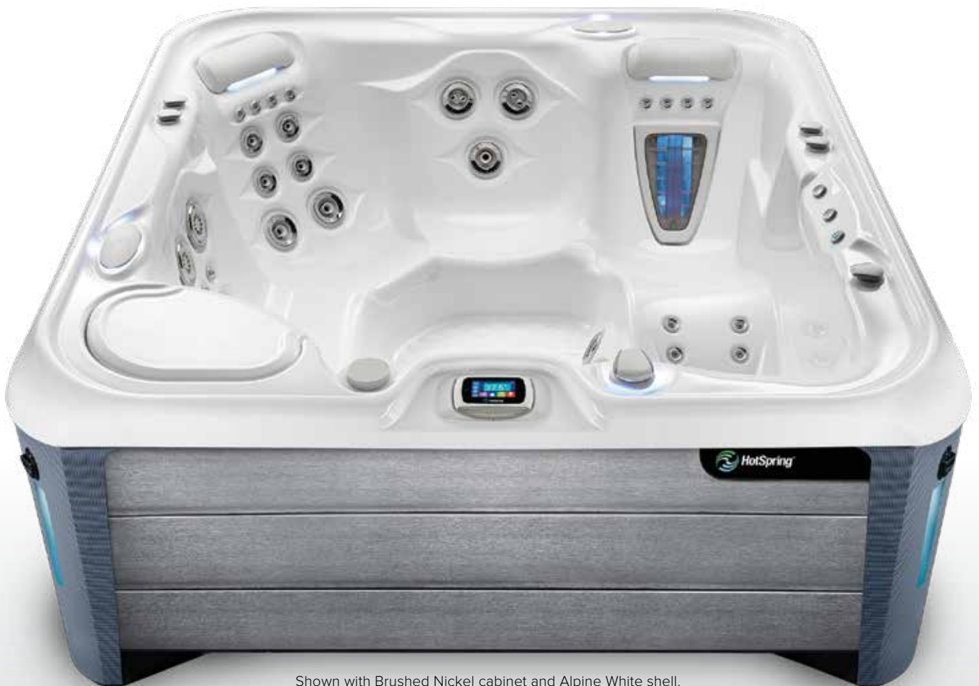
Shown with Brushed Nickel cabinet and Alpine White shell.

Our designers carefully selected a distinctive colour palette with six cabinet finishes and a variety of shell colours so you can create a look that is just right for you.