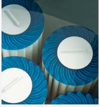
100% Filtration SilentFlo Circulation