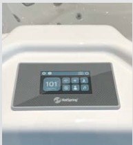
Colour LCD Touchscreen