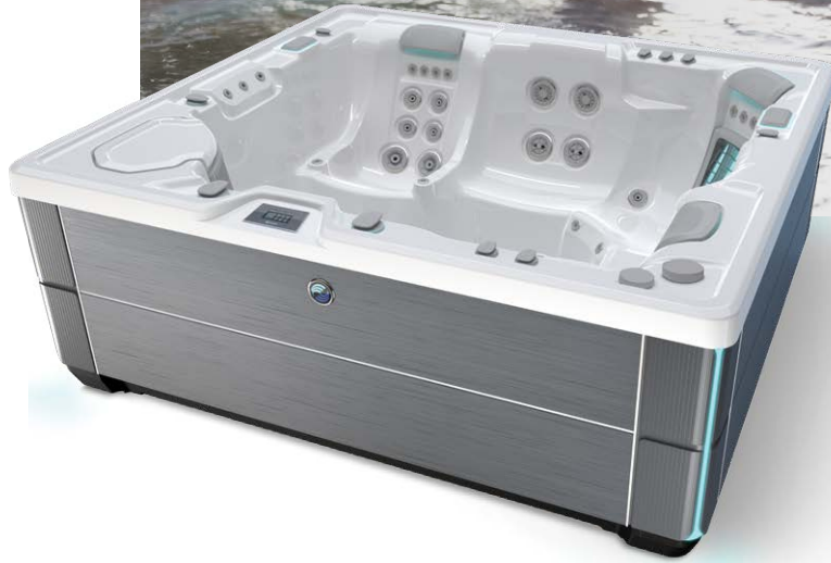
Shown with Alpine White Shell and Charcoal Cabinet

People Seating Jets Voltage 5 Seats Lounge 55 Jets 230 V