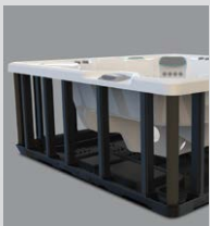
Polymer Substructure & Base Pan