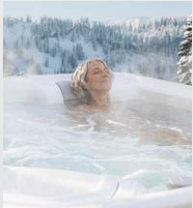
Super Energy Efficient