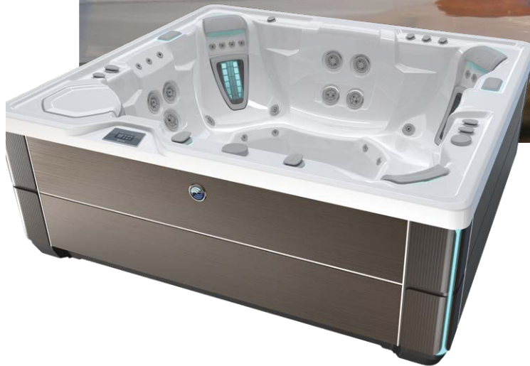
Shown with Alpine White Shell and Java Cabinet

People Seating Jets Voltage 7 Seats Open 49 Jets 230 V