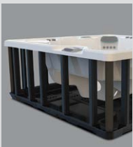
Polymer Substructure & Base Pan