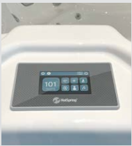
Colour LCD Touchscreen