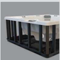
Polymer Substructure & Base Pan