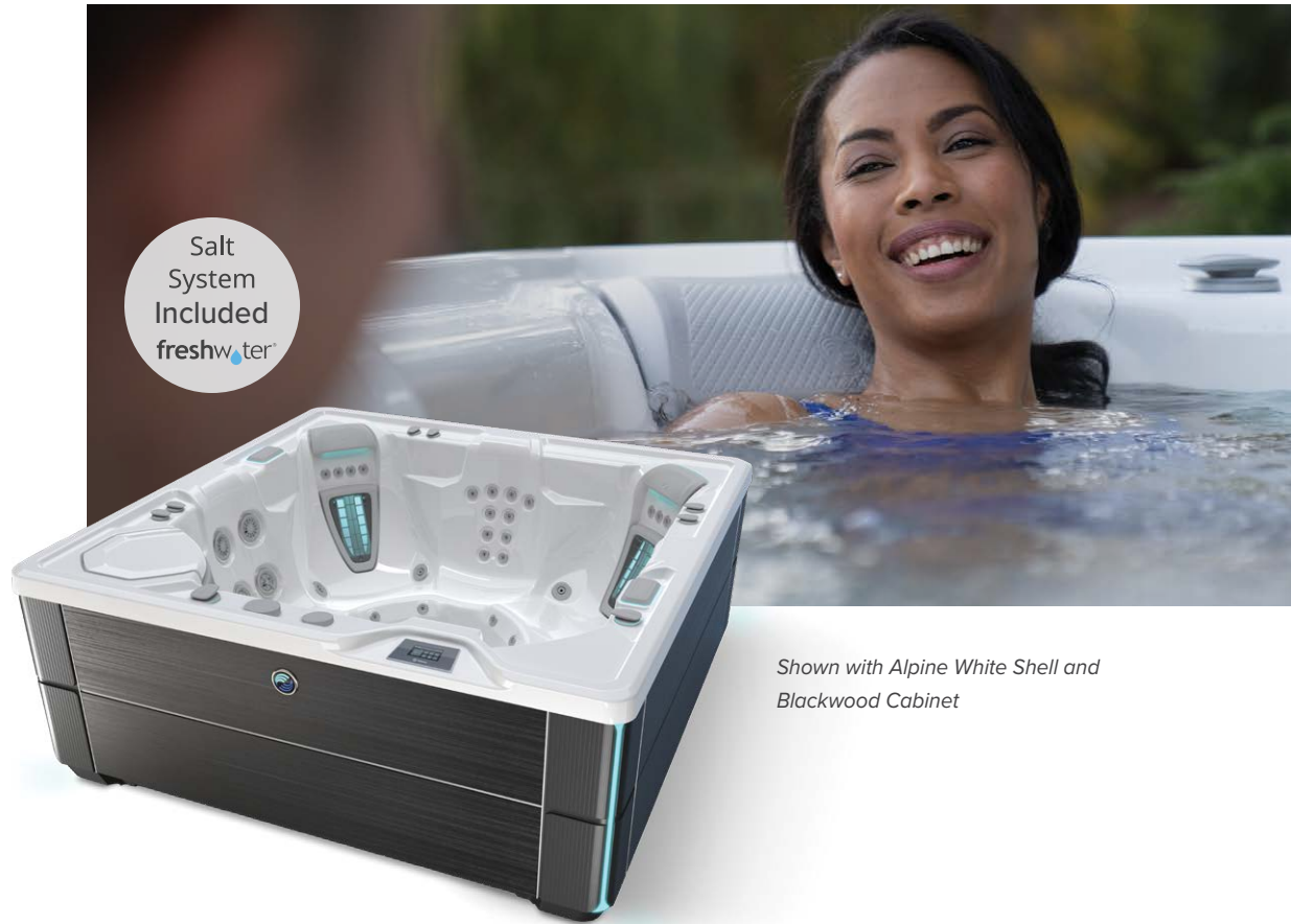
Shown with Alpine White Shell and Blackwood Cabinet

People Seating Jets Voltage 6 Seats Open 42 Jets 230 V