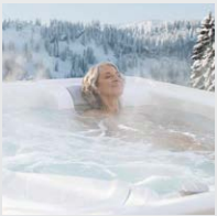
Super Energy Efficient