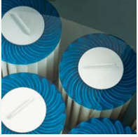
100% Filtration SilentFlo Circulation