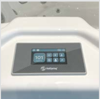
Colour LCD Touchscreen