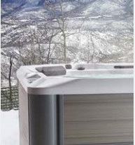
FiberCor® High-Density Insulation