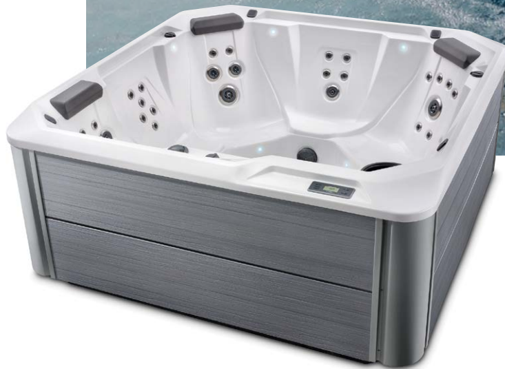
Shown with Alpine White Shell and Storm Cabinet.

People Seating Jets Voltage 6 Seats Lounge 40 Jets 230 V/ 16 amp