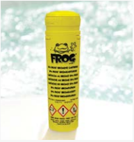
Frog® In-Line Sanitising System