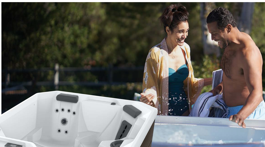
Shown with Alpine White Shell and Havana Cabinet.