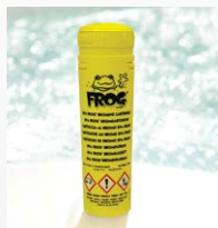
Frog® In-Line Sanitising System