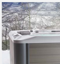
FiberCor® High-Density Insulation