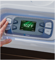
Colour LCD Display