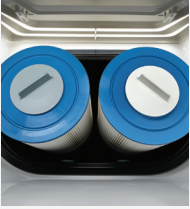
Dual Action Filtration SilentFlo Circulation