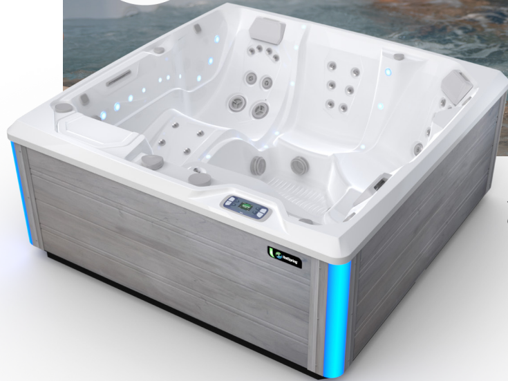
Shown with Alpine White Shell and Coastal Grey Cabinet