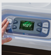
Colour LCD Display