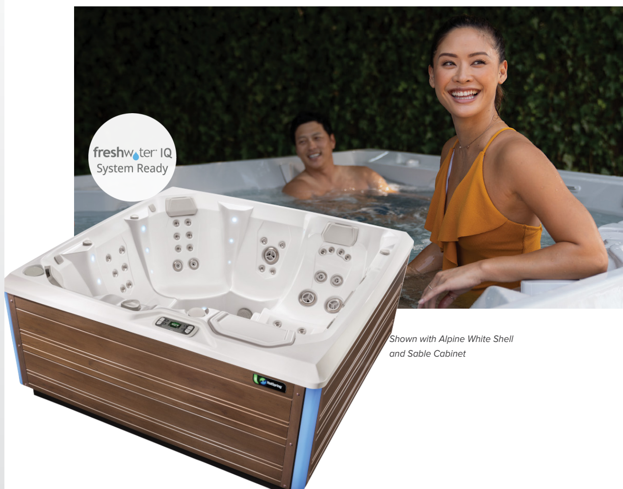
Shown with Alpine White Shell and Sable Cabinet