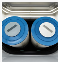
Dual Action Filtration SilentFlo Circulation