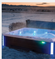
FiberCor® High-Density Insulation