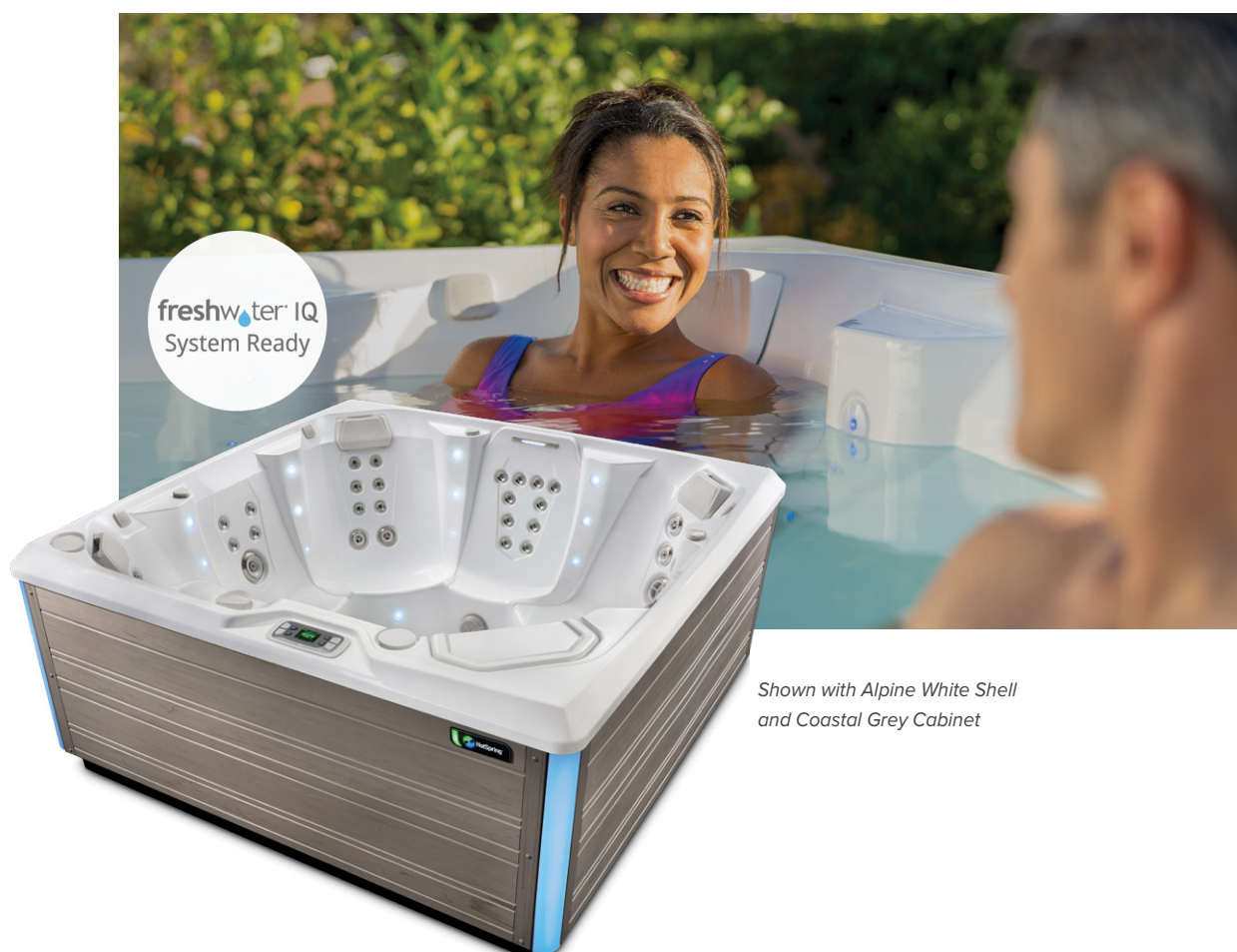
Shown with Alpine White Shell and Coastal Grey Cabinet