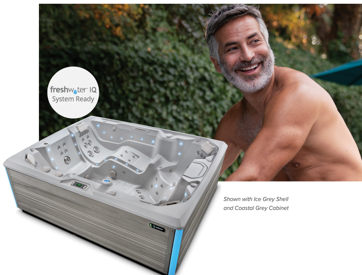
Shown with Ice Grey Shell and Coastal Grey Cabinet