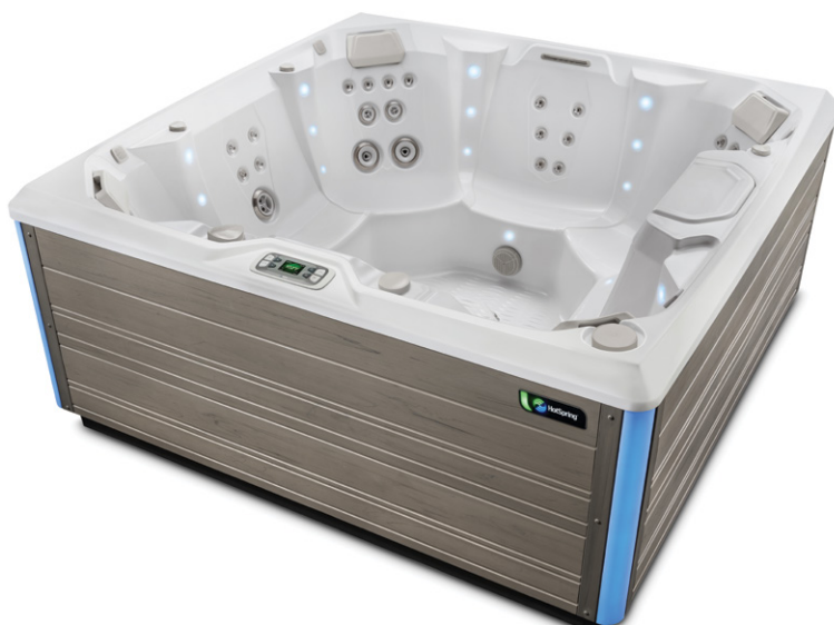
Shown with Alpine White Shell and Coastal Grey Cabinet